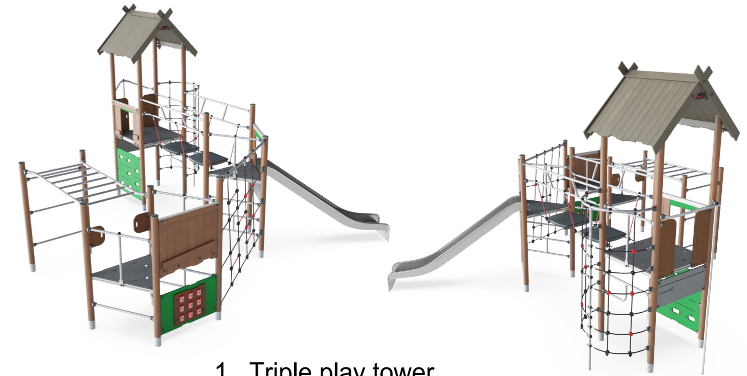
1. Triple play tower PCM310221-FSC_20377130