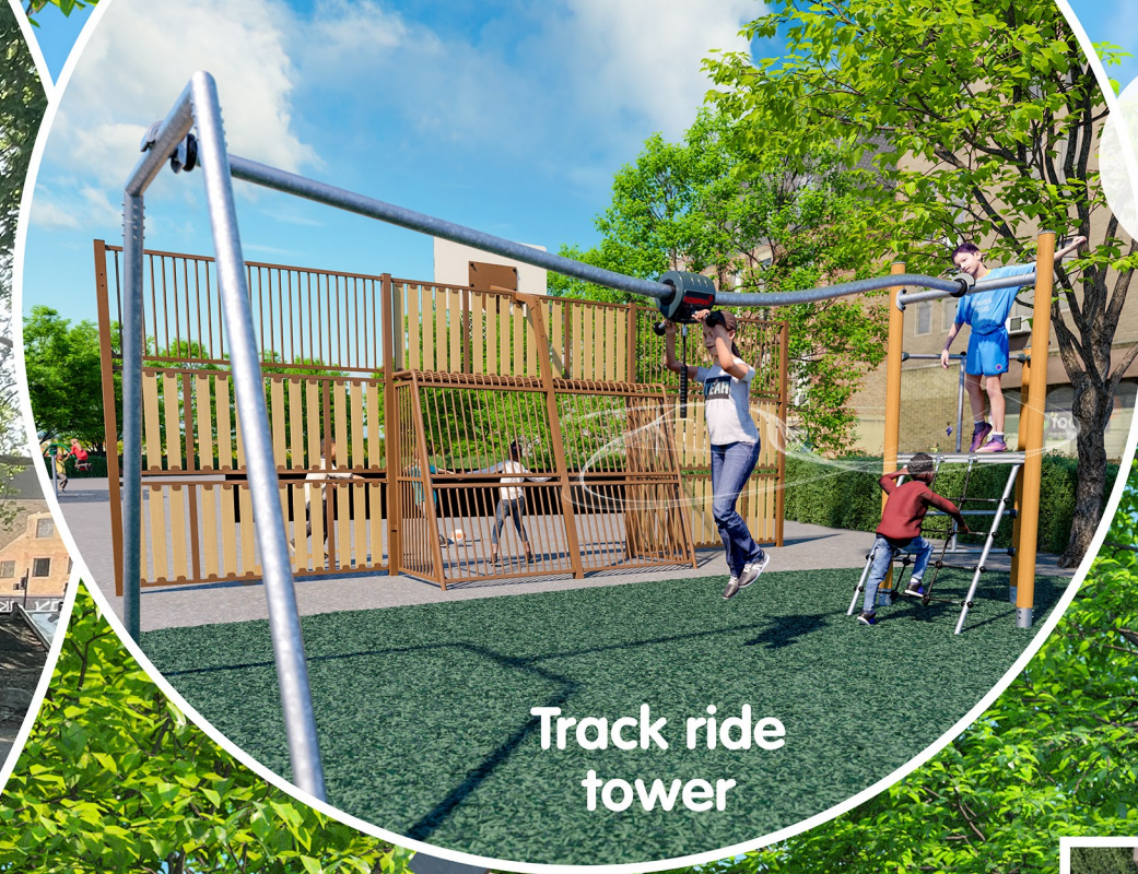
Track ride tower