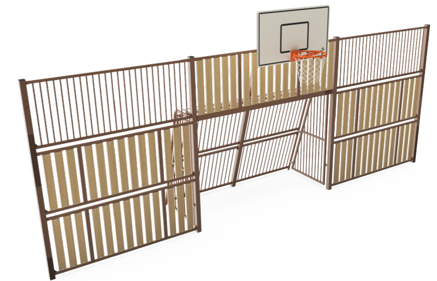
3. Multi goal, 8m FRE601501_20376016