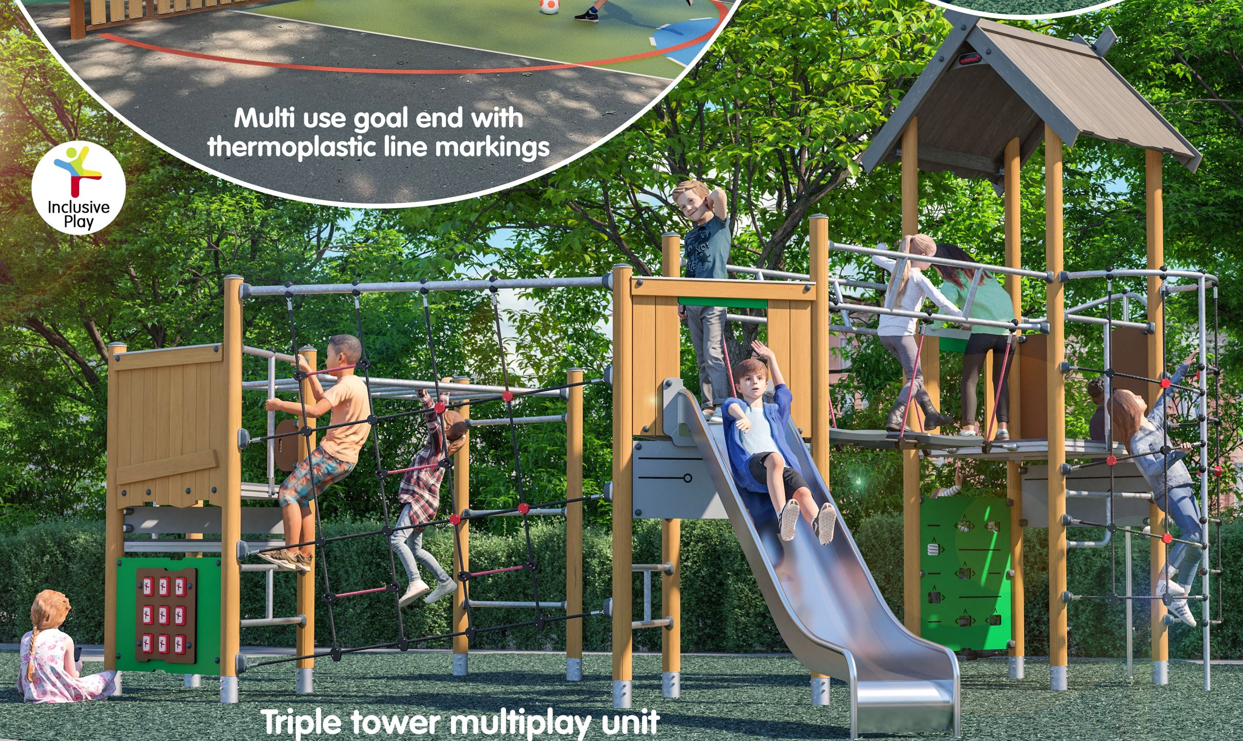
Triple tower multiplay unit