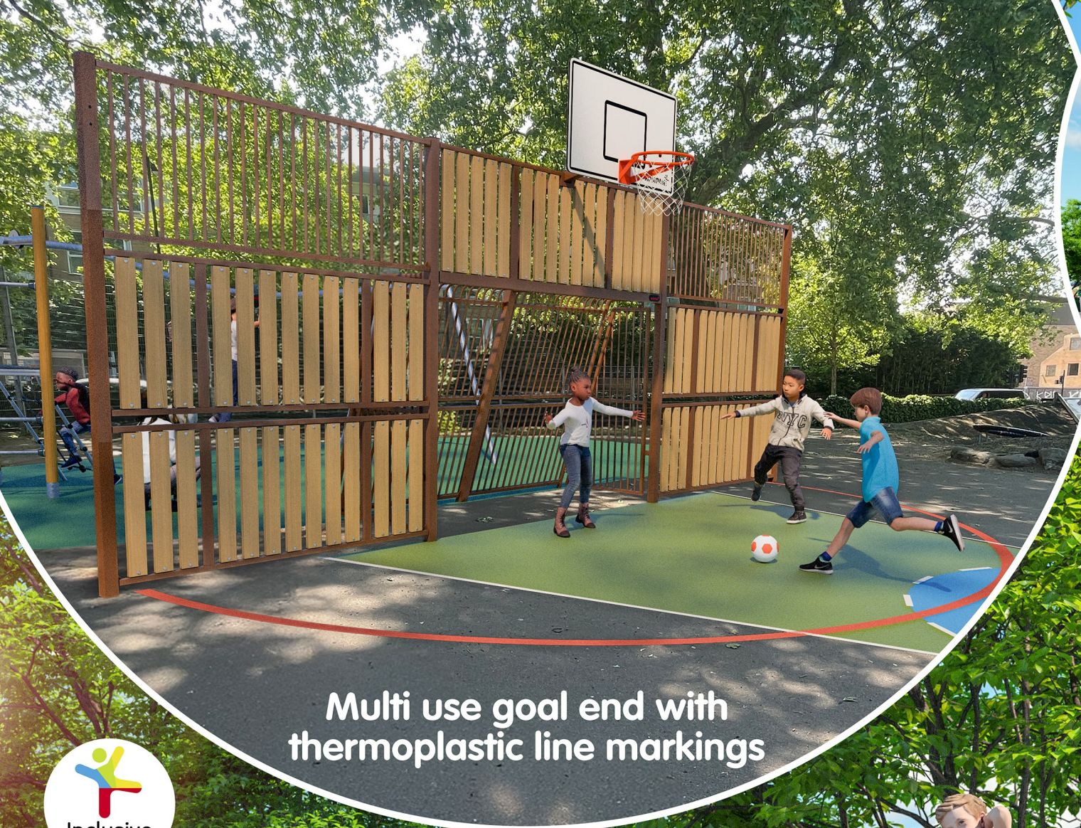
Multi use goal end with thermoplastic line markings