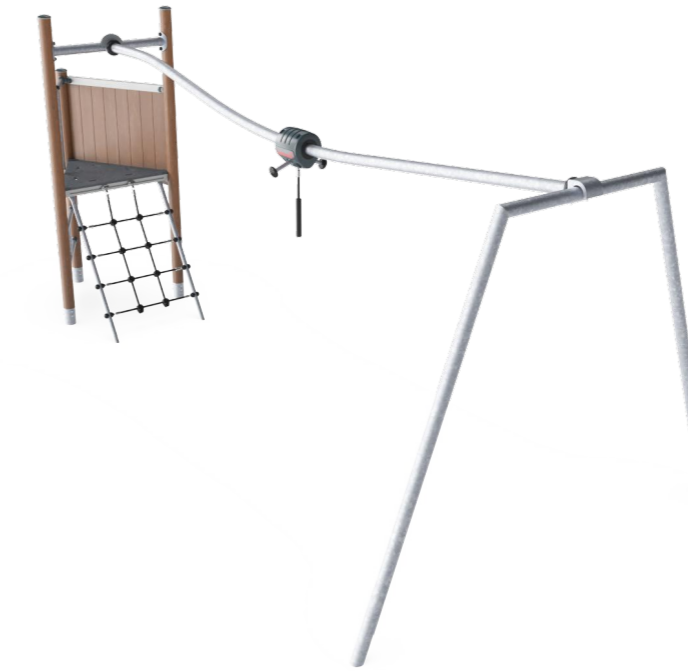
2. Track ride tower PCM110321-FSC_20377135